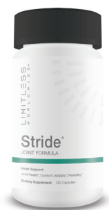
Stride ® 120 CAPSULES