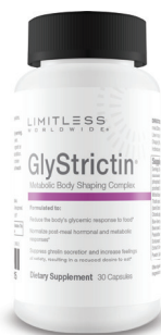
GlyStrictin ™ Complex 30 CAPSULES