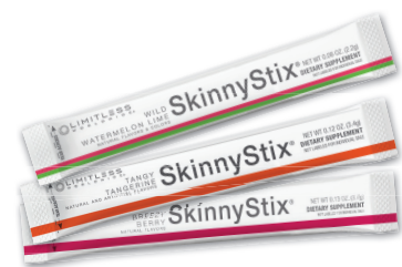
SkinnyStix ® 20 SACHETS